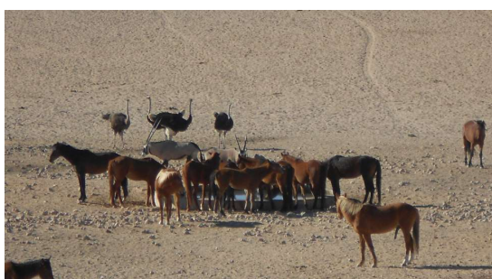
Wild horses of the Namib