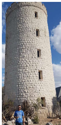
Okaukuejo's observation tower

The Etosha National Park is a must-to-see when visiting Namibia. Sitting at a waterhole at the Ukaukuejo Rest Camp will guarantee views of many antelope, elephant and perhaps a few predators as well.