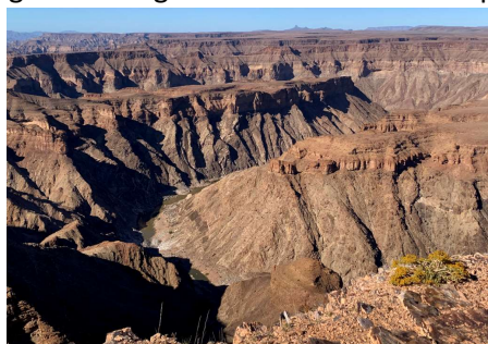
Fish River Canyon on a clear morning

We overnight in a lodge close to Keetmanshoop. Dinner is available at the venue.