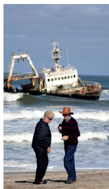
Stranded ship close to shore

Places like Wlotzkasbaken and Henties Bay will be visited before arriving in the old mining town of Uis. We'll overnight close to the Brandberg and experience a magnificent sun setting. Dinner at this venue is included in the tour package.