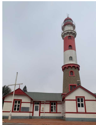
Lighthouse in Swakopmund

Tonight we'll dine at another interesting German restaurant.