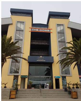
The Dome Indoor Sport Centre

Take note that it is Saturday and shops close early! In the afternoon we'll do a short drive into the countryside.