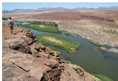
Orange River at Aussenkehr

Today you'll start to experience the vastness of this country, the small towns, the friendly people and a 'miracle' agricultural project on the banks of the Orange River.