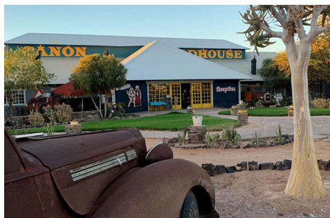
Canyon Road House